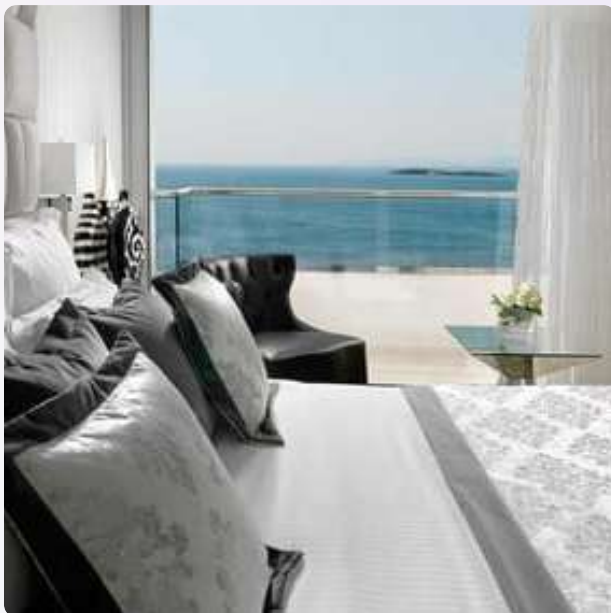
Rooms & Suites

Relax and unwind by the outdoor pool, or visit the on-site beach club for a perfect summer day.