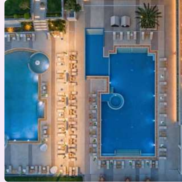
Pool & Beach

Experience the luxurious and elegant atmosphere of the hotel exterior.